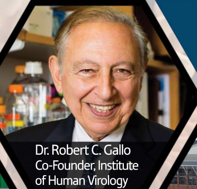
Dr. Robert C. Gallo Co-Founder, Institute of Human Virology