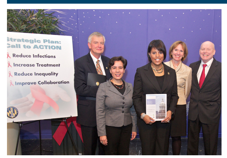
Baltimore City HIV/AIDS commissioners presenting the Baltimore City HIV/AIDS Strategy to Mayor Stephanie Rawlings-Blake and Dr. Oxiris Barbot, Baltimore's Commissioner of Health.

On the eve of World AIDS Day 2011, Mayor Stephanie Rawlings-Blake received from the Baltimore City Commission on HIV/AIDS an aggressive plan to dramatically reduce new HIV infections, expand treatment, coordinate services and make a significant improvement to the status of the HIV/AIDS crisis in Baltimore by 2015. The plan adopted specific, measurable goals in four key areas and outlines a variety of strategic initiatives to achieve those goals in an accelerated timeframe.