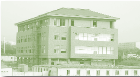
Construction of the new SGIV building is now complete

On June 22, 2009, the Shandong Academy of Medical Sciences (SAMS) announced the establishment of the Shandong Gallo Institute of Virology (SGIV), named after world renowned virologist and pioneer in retrovirology