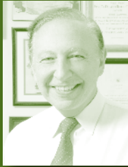
Robert C. Gallo, M.D.

Robert C. Gallo, M.D., Director, Institute of Human Virology, Professor of Medicine and Microbiology and Immunology, University of Maryland School of Medicine, and Co-Director of Viral Oncology, University of Maryland Marlene and