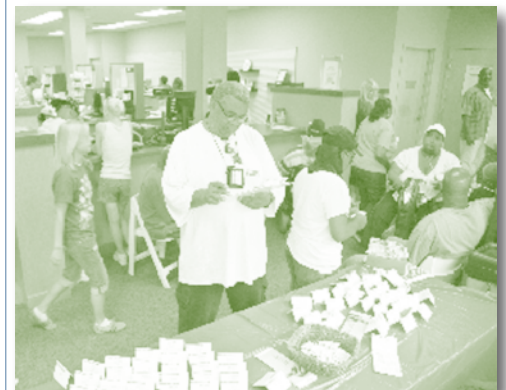
Inside one of the busier testing sites, Bio Scripts.