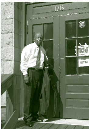
Congressman Cummings prepares to enter Seventh Metro Church, Baltimore – one of 14 testing sites.