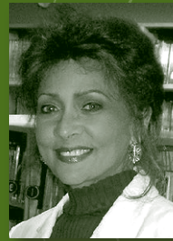
Janet Langhart Cohen

Janet Langhart Cohen is a former TV and print journalist who has interviewed corporate leaders and major heads of state. Her career began in Chicago, Illinois with CBS-TV. She received an Emmy nomination for role on the ABC-TV program, Good Morning in Boston . Ms. Langhart Cohen co-hosted the NBC-TV network program, America Alive before becoming a weekly columnist for the The Boston Herald newspaper and a spokesperson for US News and Report . Ms. Langhart Cohen has appeared on and hosted the C-SPAN TV program, Afterwords .