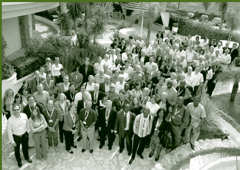
2010 meeting attendees gather together for a group picture.