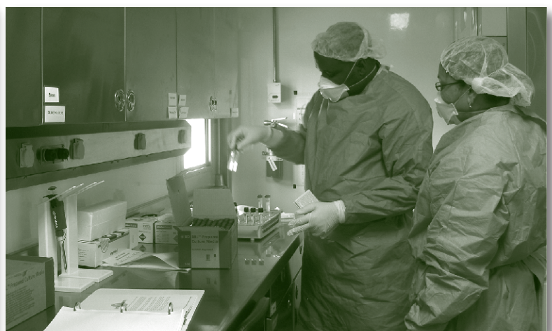
Collecting supplies for culture and drug sensitivity training