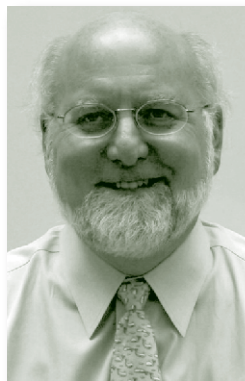
Robert Redfield, M.D.

Robert Redfield, M.D., Associate Director, Institute of Human Virology, Professor of Medicine, Director of the Infectious Diseases Division, the University of Maryland School of Medicine, received a one-year $2,010,000