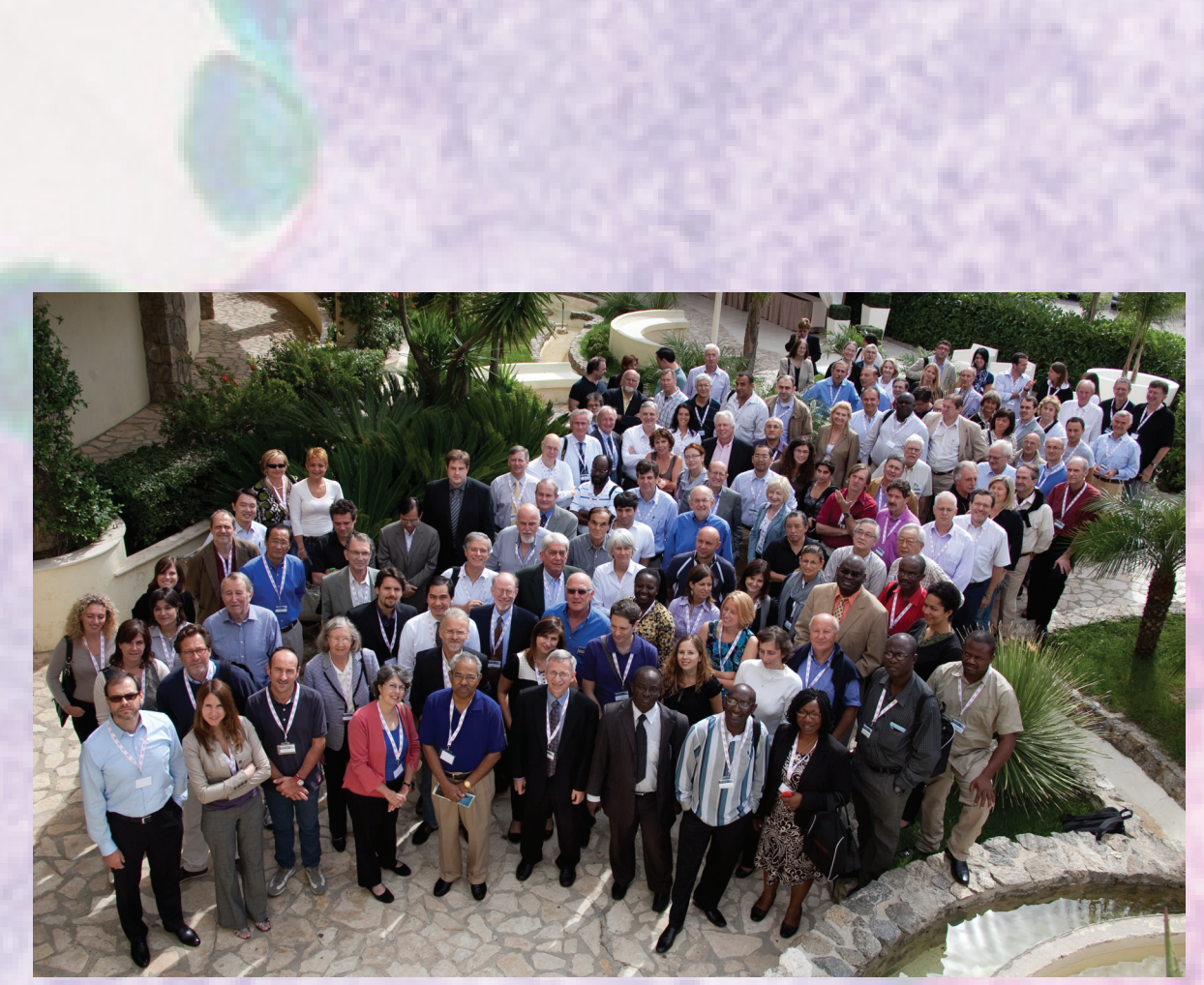
12th Annual IHV International Meeting attendees.