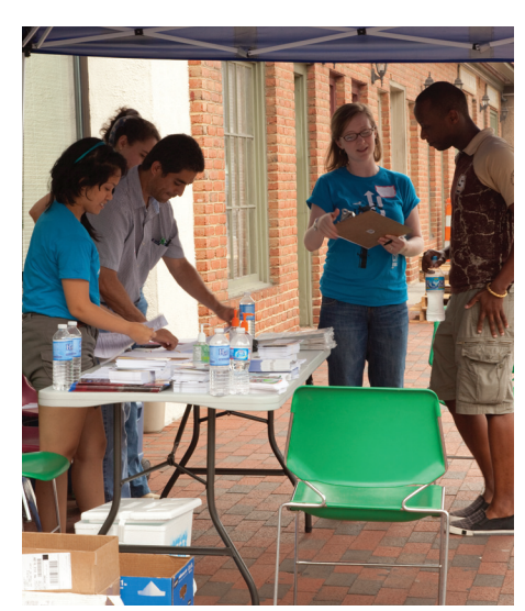
JACQUES Initiative's Project SHALEM.

As part of its ongoing work, the Division of Clinical Care and Research is an active participant in the Adult AIDS Clinical Trials Group (AACTG), a network of international experts in HIV/AIDS and co-morbidities, funded by the Department of Health and Human Services, National Institutes of Health through the National Institute of Allergy and Infectious Diseases. IHV has participated in numerous clinical trials and its clinics in Maryland play a key role in extrapolating challenges affecting the AACTG. Moving forward, the Division of Clinical Care and Research is positioned to assist the AACTG as it addresses preventative and therapeutic vaccines, endorgan disease and inflammation, and "HIV cure," focusing on viral eradication and HIV reservoirs.