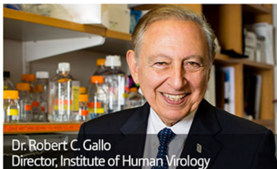
Dr. Robert C. Gallo Director, Institute of Human Virology